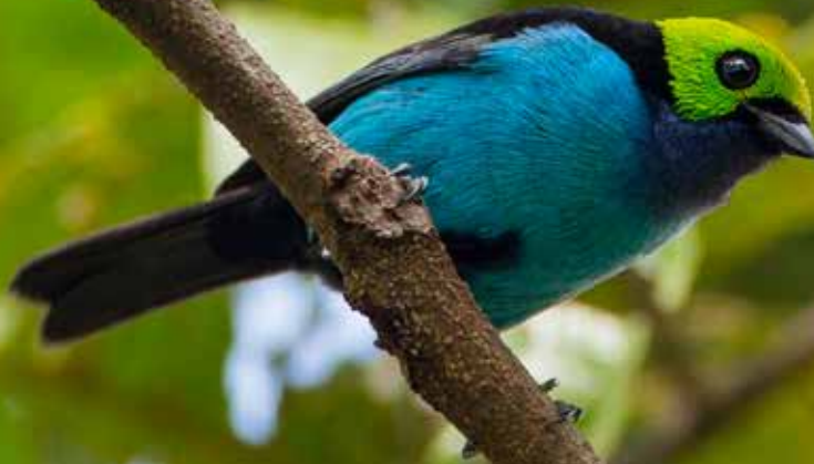
Paradise Tanager